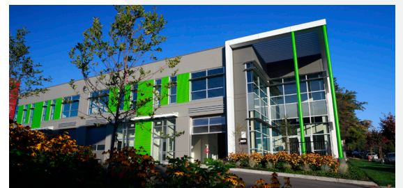
INTRAUrBAN LAUREL, VANCOUVER

While historic numbers are no indicator of future performance, the increase in value of other IntraUrban Business Parks speak for themselves.